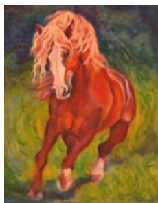
Tuscani Dundee, 18x14", oil on masonite

Thank you to everyone who voted! Here are the other paintings in the Top 5.